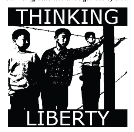
a bombastic interactive libertarian anarchist talk program